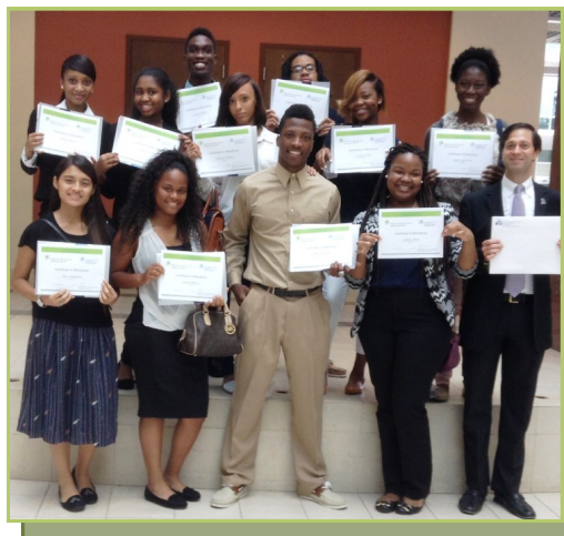
William Turner Technical Arts High School students at Cyber Security Awareness Event

Students from William Turner Technical Arts High School's Public Service program also participated in this event. The students learned the importance of protecting their security, being aware of what to share and what not to share on the internet, and how to recognize a corrupt file or website. The students participated in hands-on lessons with the faculty and were able to