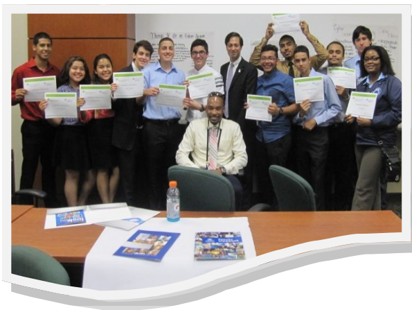
L.E.O.M.H.S. students at Cyber Security Awareness

Law Enforcement Officers' Memorial High School's 911 program is State approved through the Department of Health. Through this program students participate in a rigorous training curriculum, which provides advanced and technical learning in 911 telecommunications. Specialized topics include the following: Emergency Management, Emergency Fire/Dispatch/Medical Dispatching, Call Classification/Prioritization, History of 911, Telecommunicator's Roles/Responsibilities, Professionalism and Ethics, etc. Upon completion of the 260 hour program, students are eligible to sit for the state of Florida examination required to become State Certified 911 Telecommunicators. Students also engage in laboratory exercises, by actively participating and visiting several 911 centers in Miami-Dade and Broward counties.