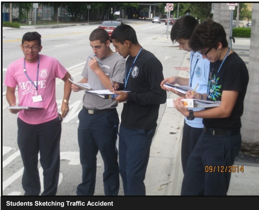
Students Sketching Traffic Accident